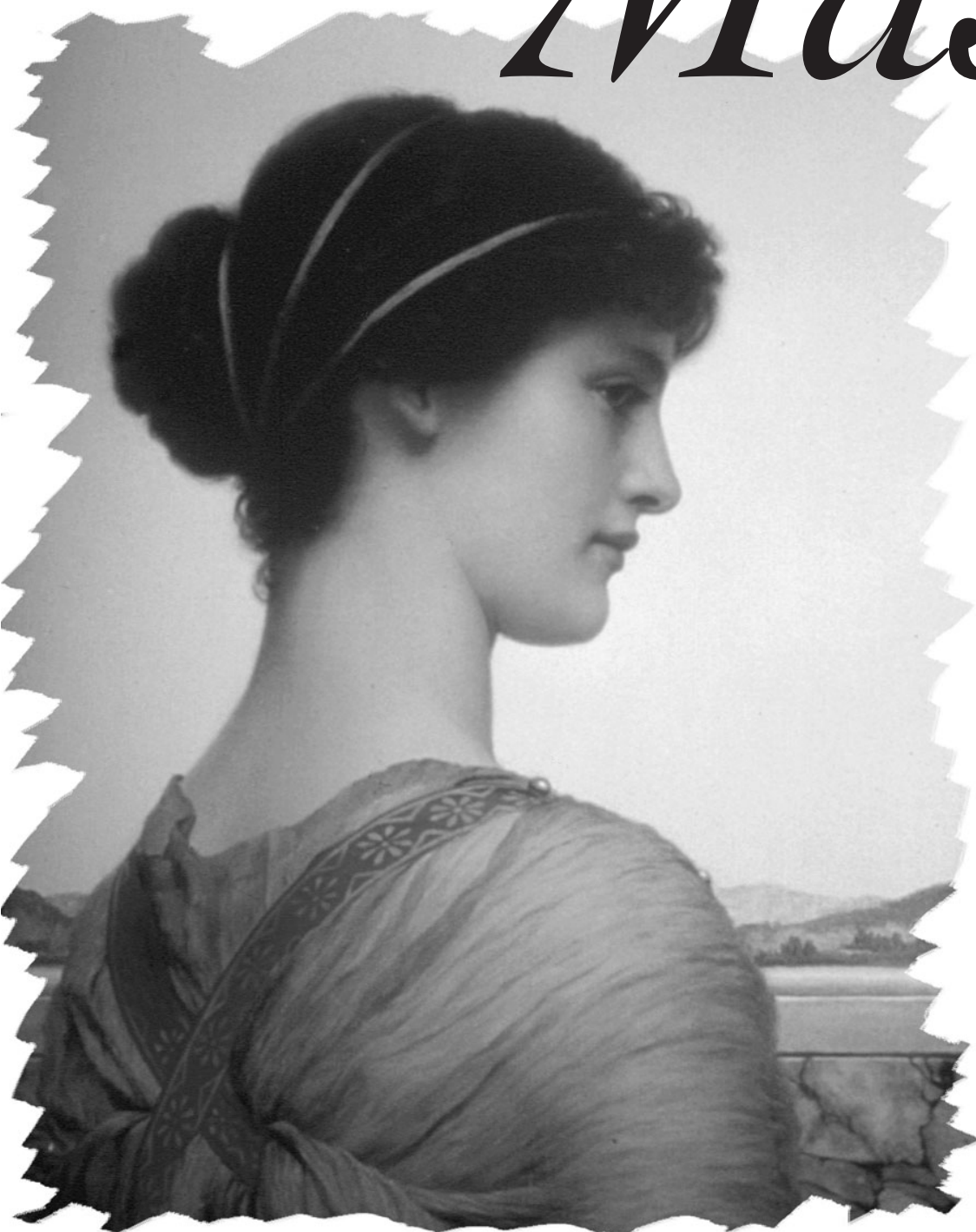
"Classical Beauty" (John William Godward)

Who would've believed that when Picasso painted his "Young Girl On A Sofa" in 1949, that the piece would end up on display in Sioux City, Iowa? The artistic surprises don't stop there, as the Sioux City Art Center hosts a premier exhibition of massive proportions featuring works by everyone from Gauguin to Chagall currently on display until Sunday, May 14. The presentation has been dubbed Modern Masters: From Corot to Kandinsky , and provides an opportunity for the Siouxland area to witness firsthand the genius of several European artists whose works have withstood the test of time.